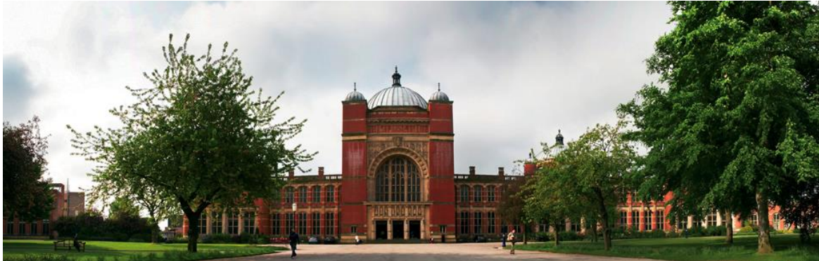
The Aston Webb Building, University of Birmingham's Edgbaston Campus

As I walked through the quiet campus green at the University of Birmingham on a cold 8 th November evening I reflected on the closing of a chapter in my postgraduate studies; the end of organizing BE Forums , TUT Projects , and BE Socials , because Monday the 11 th was the start of something new and exciting; the start of my year working as Education and Public Engagement Manager at the Egypt Exploration Society .