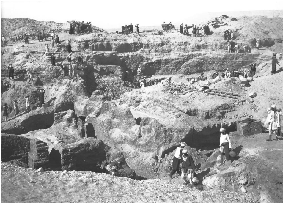
An image taken during the EES excavations at Armant